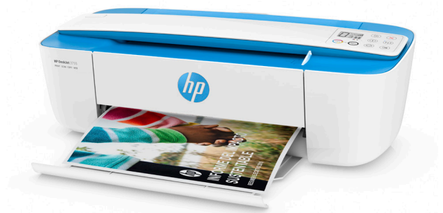
HP DeskJet 3755 All-in-One Printer J9V90A 975 points

Enroll now at hpbusinessrewards.com/join/integrity to make your purchases go further. And earn 150 bonus points the first time you log in.